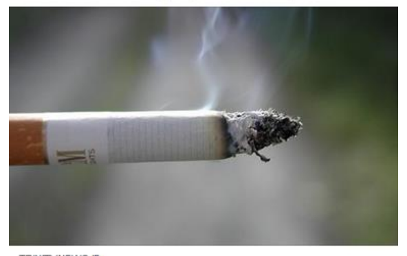
TRINITYNEWS.E 20% of participants quit smoking after Trinity's free course

Tobacco free zones help people who want to quit